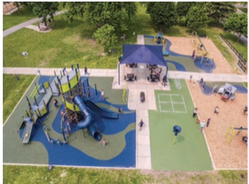
Lexington Park Playground