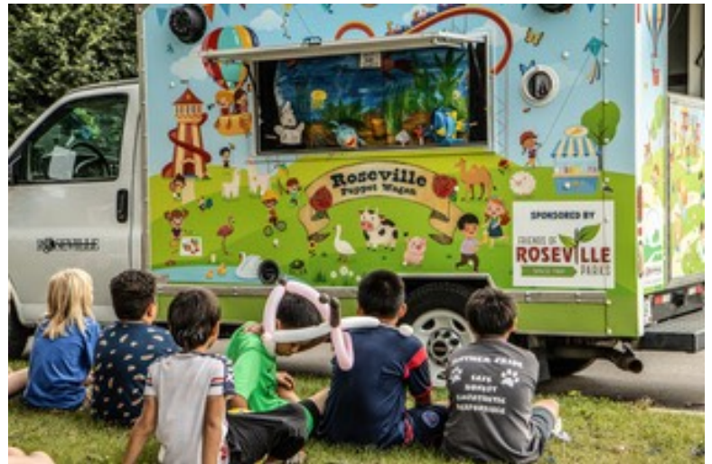
New Puppet Wagon