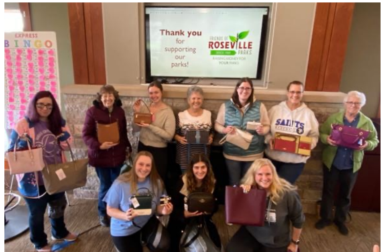
You, too, could win a designer handbag!

Saturday, November 8 Cedarholm Community Building