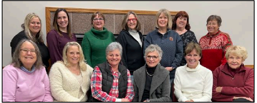
2024 FOR Parks Board (partial)